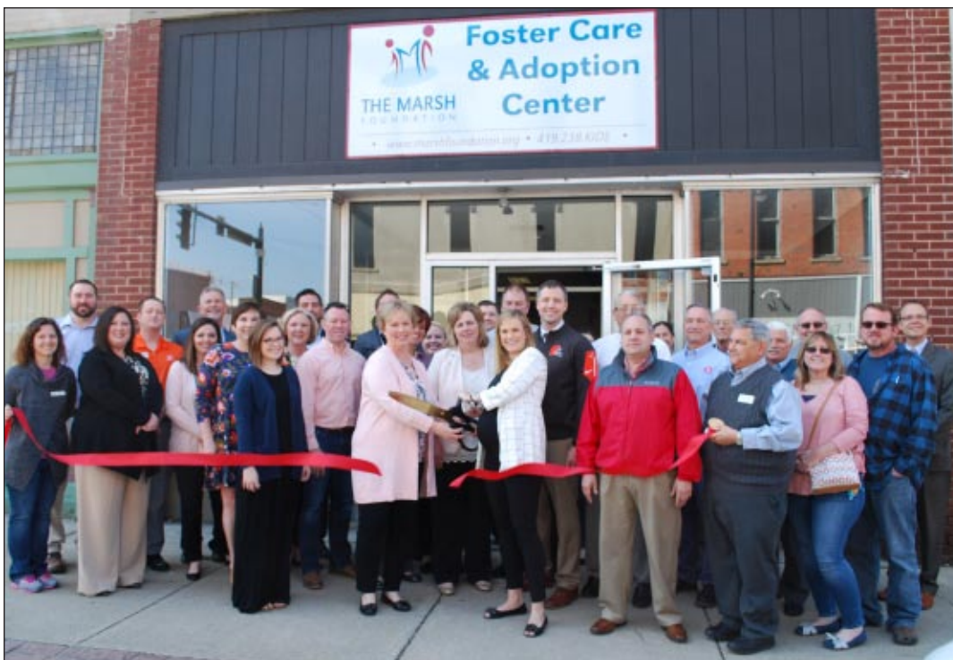
An official ribbon cutting was held earlier this year at the new, downtown Marsh Foundation Foster Care & Adoption Center.