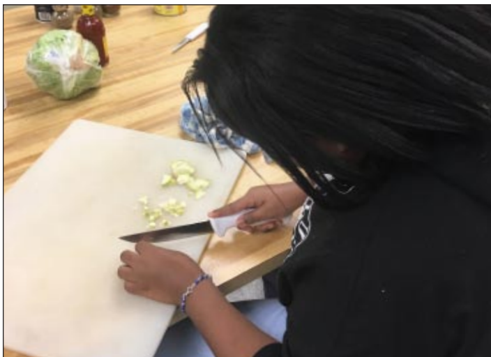
The IDL group has recently started a series of cooking classes which involve planning, budgeting and preparing the meal.