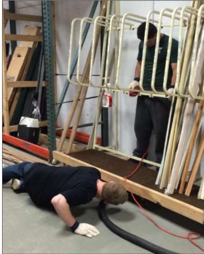
Youth volunteer at the Habitat for Humanity Restore in Lima during one of their Spring Break service projects.

One group of boys volunteered at the Lima Rescue Mission, serving dinner to homeless men and cleaning up after the meal. Another group went to