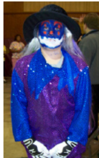
Pictured is a Marsh Hall youth in his award winning Jester costume.